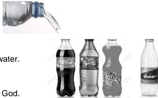
Fun Friends Business God

If you start with God, you can get the right balance.